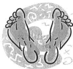
bare + foot